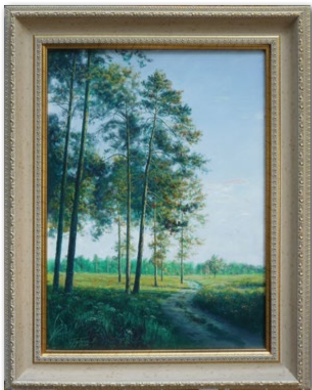
№14 Morning light canvas, oil, 50x35, 2009 Crépuscule du matin huile sur toile, 50x35, 2009

Awarded by the diploma for the participation in the 6th Art Festival «Blessing» (Project № 40, Magdeburg).