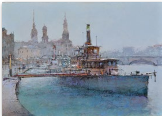
№62 Dresden. Elbe canvas, oil, 50x70; 2012 Dresde. Elba huile sur toile, 50x70; 2012

Awarded by the diploma for the participation in The collection № 5 «To Italy with Whole Heart» (Art Festival HOBBY SHOW ROMA - Italy, Roma, 14-16 October, 2011; Italy, Milano, 4-6 November, 2011).