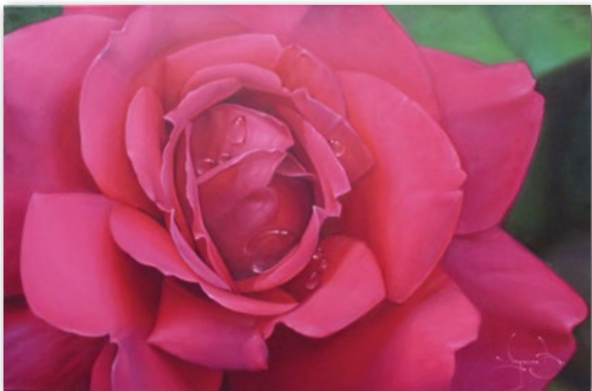
№100 Pink rose canvas, oil, 60x90, 2014 La rose de rose huile sur toile, 60x90, 2014