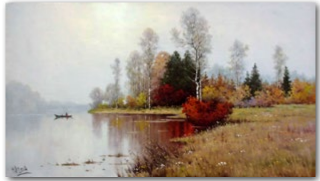
№38 Calm morning canvas, oil, 40x70, 2014 Le matin calme huile sur toile, 40x70, 2014