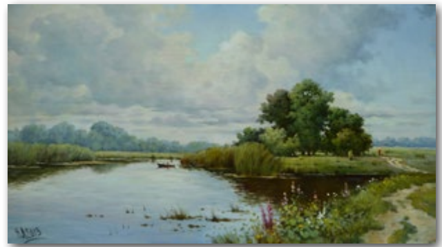
№40 Quiet pond canvas, oil, 40x70, 2015 Sur la mare calme huile sur toile, 40x70, 2015