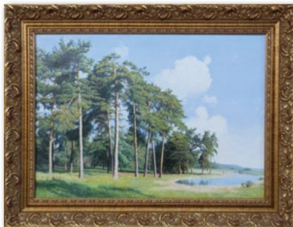
№59 : Edge of forest canvas, oil, 50x70; 2015 : Au bord de la forêt : huile sur toile, 50x70; 2015

Participant of the Project № 62»Aviart-2012». Record for Guinness World Records is set!. Participant of exhibition-collection № 6 «Nature's gentle breath.» (Residential Club District «Cherry Town»).