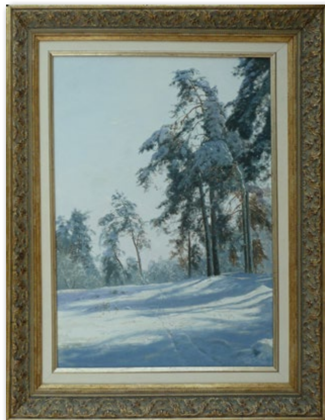
№13 Once at winter evening canvas, oil, 50x35, 2010 Un soir d'hiver huile sur toile, 50x35, 2010

Artworks are on permanent exhibition in the gallery «Globus». Participant of exhibition-collection № 1 «Field bouquet» (Montenegro, Budva). Participant of exhibition-collection № 2 «Dew» (Slovakia, Bratislava; Czeska Republika, Praga). Participant of exhibition-collection № 5 «To Italy with Whole Heart» (Italy, Roma; Milano). Awarded by the diploma for the participation in the Exhibition «Blessing» (Project № 40, Berlin).