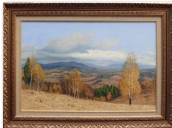
№102 : October in the Carpathians canvas, oil, 60x90, 2014 : Octobre en Carpates : huile sur toile, 60x90, 2014