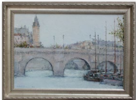
№31 Paris. Pont Neuf canvas, oil, 40x60, 2014 Paris. Pont Neuf huile sur toile, 40x60, 2014

Awarded by the diploma for the participation in The collection № 2 «Dew» (Slovakia, Bratislava; Czeska Republika, Praga).