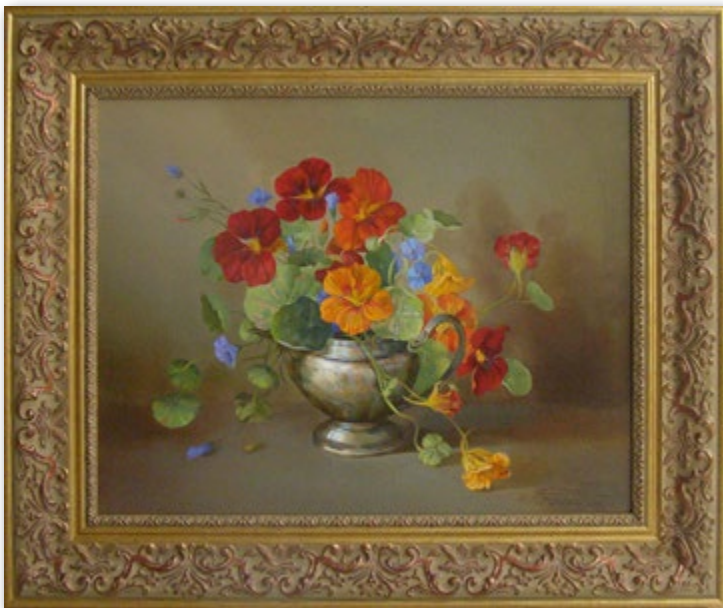
№17 Nasturtium canvas, oil, 40x50, 2013 Capucin huile sur toile, 40x50, 2013