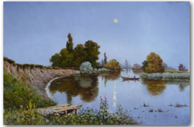
No26 White moon canvas, oil, 40x60, 2015 Sous la lumière blanche de la pleine lune huile sur toile, 40x60, 2015