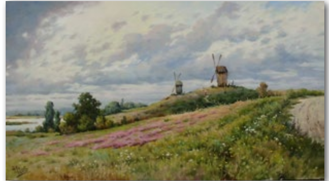
№36 Windmills canvas, oil, 40x70, 2015 Moulins à vent huile sur toile, 40x70, 2015