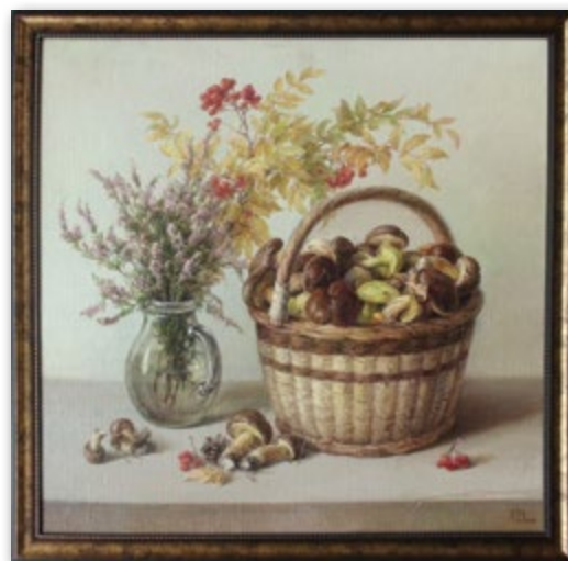
Still life with mushrooms canvas, oil, 50x50, 2010

She has done illustrations for «Music School» a Ukrainian Language music book for kids as well as many envelopes and postcards for UkrPoshta and Baltia Druk.