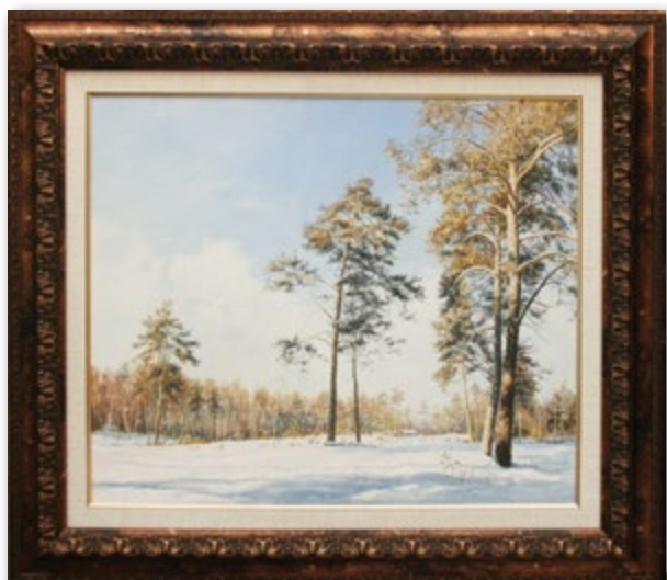
№48 : Frosty day canvas, oil, 50x60, 2011 : Un jour de l'hiver : huile sur toile, 50x60, 2011

Awarded by the diploma for the participation in The collection № 6 «Nature's gentle breath.»(Residential Club District «Cherry Town»).