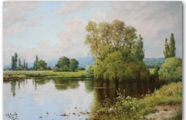
No24 Summer noon canvas, oil, 40x60, 2015 Début de l'après-midi huile sur toile, 40x60, 2015