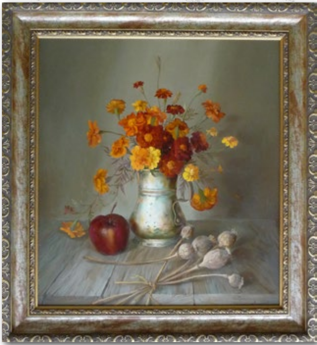
№52 Marigolds canvas, oil, 55x50, 2011 Tagète huile sur toile, 55x50, 2011