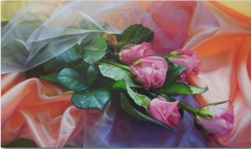
No110 : Pink roses canvas, oil, 60x100, 2015 : Les roses de roses : huile sur toile, 60x100, 2015