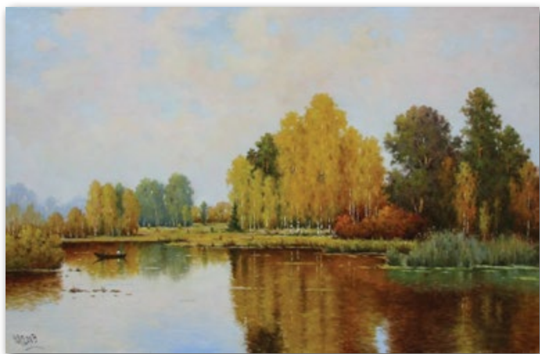
No70 : Gold of autumn canvas, oil, 50x80, 2015 : Or d'automne : huile sur toile, 50x80, 2015