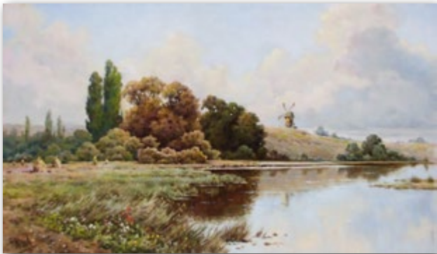
№37 Ukrainian landscape canvas, oil, 40x70, 2014 Paysage ukrainien huile sur toile, 40x70, 2014