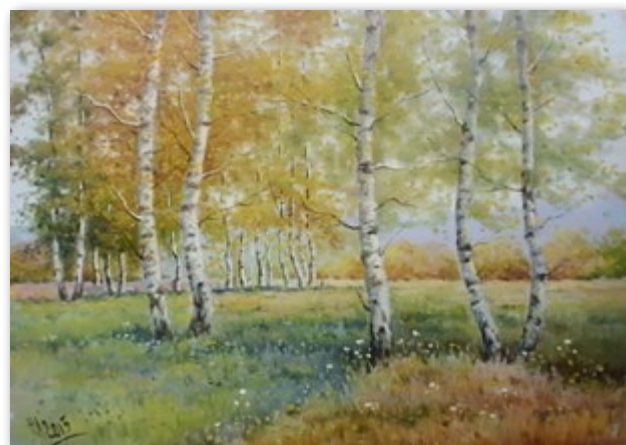
№6 Autumn. Birches canvas, oil, 35x50, 2015 Automne. Les bouleaux huile huile sur toile, 35x50, 2015

He has been awarded by the diploma for the participation in the 6th Art Festival Blessing (Project № 40, Magdeburg).