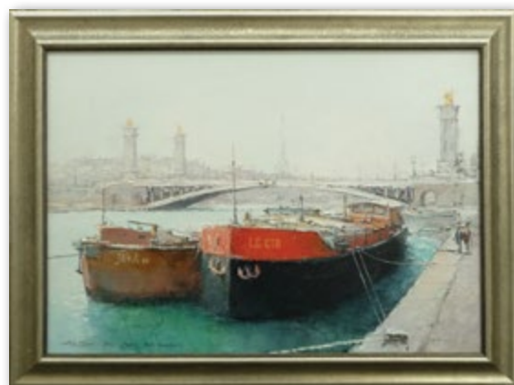
№61 Paris. Pont Alexandre III canvas, oil, 50x70, 2012 Paris. Pont de Aleksandr III huile sur toile, 50x70, 2012