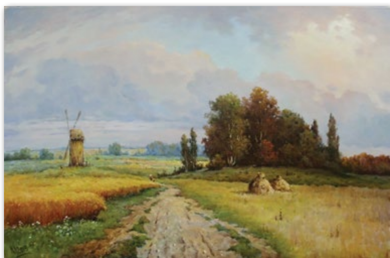
No69 : Grain is ripe canvas, oil, 50x80, 2015 : Pain était mûr : huile sur toile, 50x80, 2015