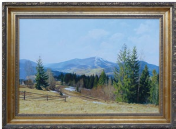
№101 : Early spring canvas, oil, 60x90, 2015 : Un soleil de printemps : huile sur toile, 60x90, 2015

Awarded by the diploma for the participation in The collection № 6 «Nature's gentle breath.»(Residential Club District «Cherry Town»).