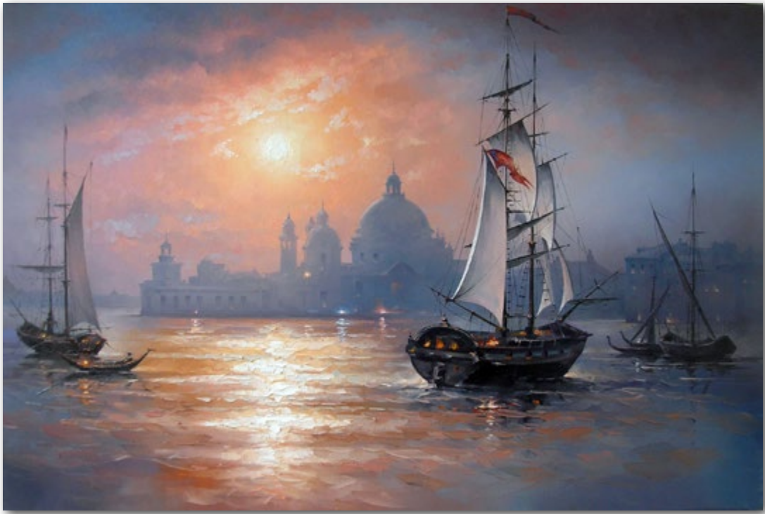
№97 Venice canvas, oil, 60x90, 2014 Venise huile sur toile, 60x90, 2014