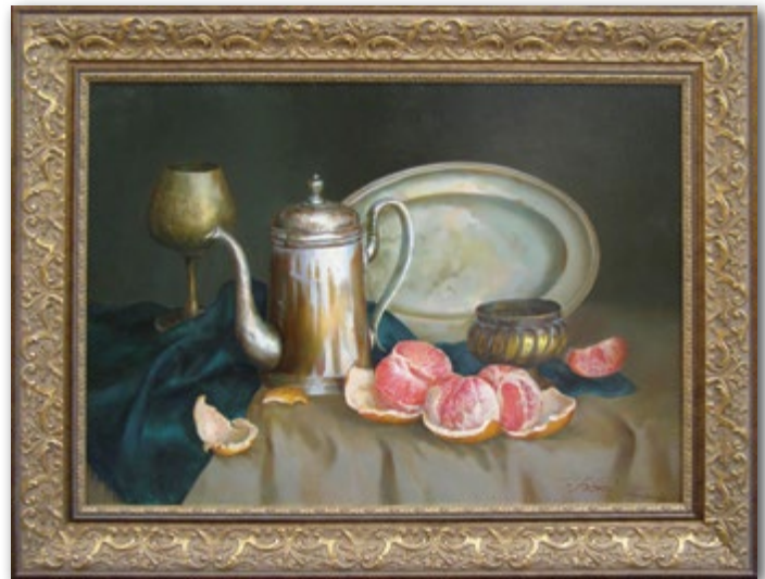
Still life with greyfrutom canvas, oil, 50x70, 2014 Nature morte avec le pamplemousse huile sur toile, 50x70, 2014 №63