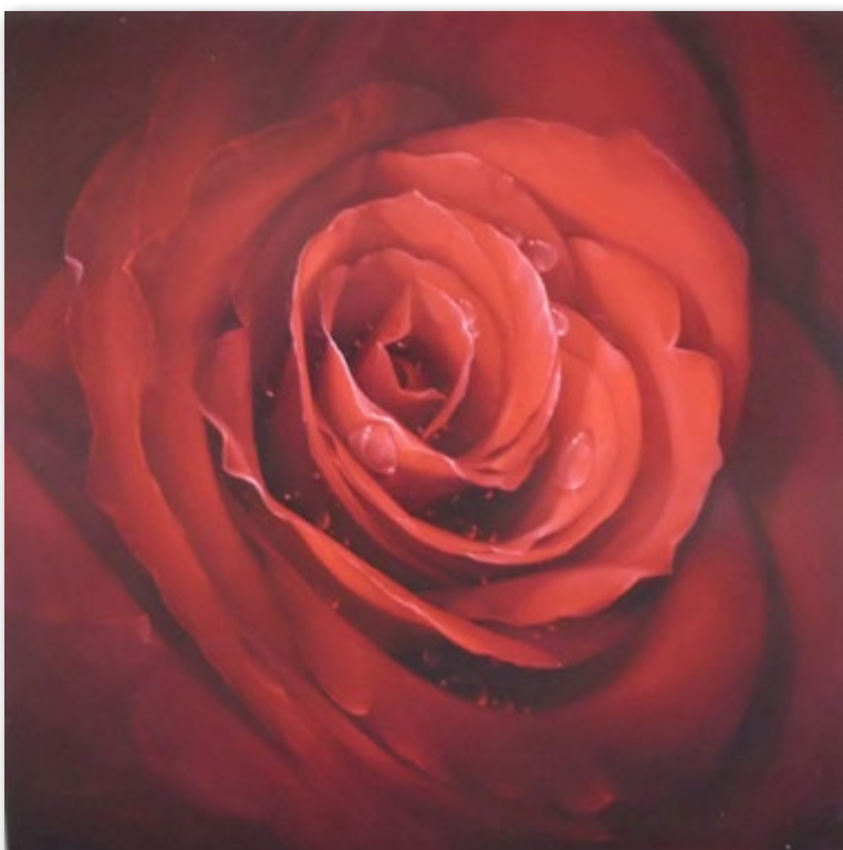
No122 : Red Rose canvas, oil, 80x80, 2015 : La rose blanche : huile sur toile, 80x80, 2015