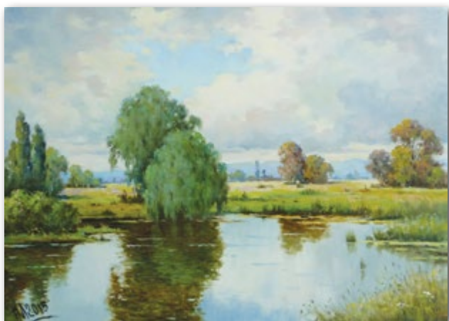
№4 Willows over the river canvas, oil, 35x50, 2015 Saules sur la face de l'eau huile sur toile, 35x50, 2015

The remarkable ability to work (six days a week, the whole daylight time), no alcohol for the last 20 years, have allowed the master to paint approximately 4000 works for the forty-years of creative work.