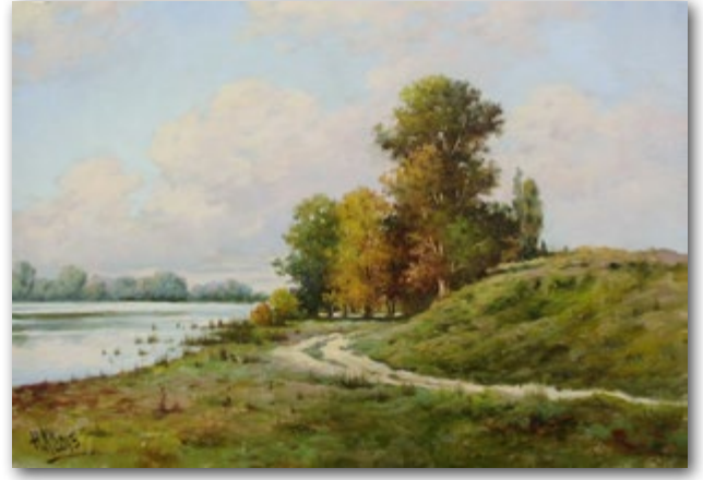
No10 Summer's day canvas, oil, 35x50, 2015 Jour d'été huile sur toile, 35x50, 2015