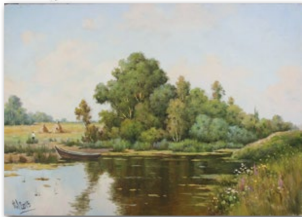
№3 Bay canvas, oil, 35x50, 2015 Baie huile sur toile, 35x50, 2015