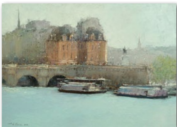
№60 The new bridge canvas, oil, 50x70, 2012 Pont-Neuf huile sur toile, 50x70, 2012