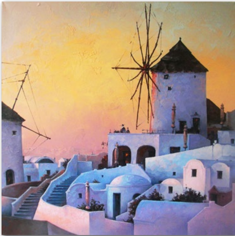
№120 Santorini canvas, oil, 80x80, 2013 Santorini huile sur toile, 80x80, 2013