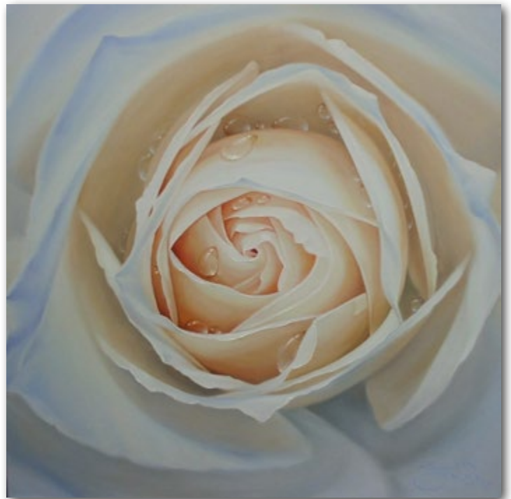
No121 : White Rose canvas, oil, 80x80, 2015 : La rose blanche : huile sur toile, 80x80, 2015