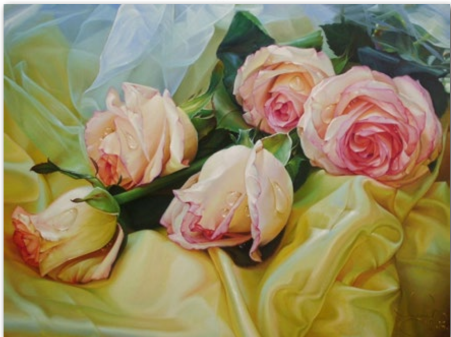
№89 Pink roses canvas, oil, 60x80; 2015 Les roses de roses huile sur toile, 60x80; 2015