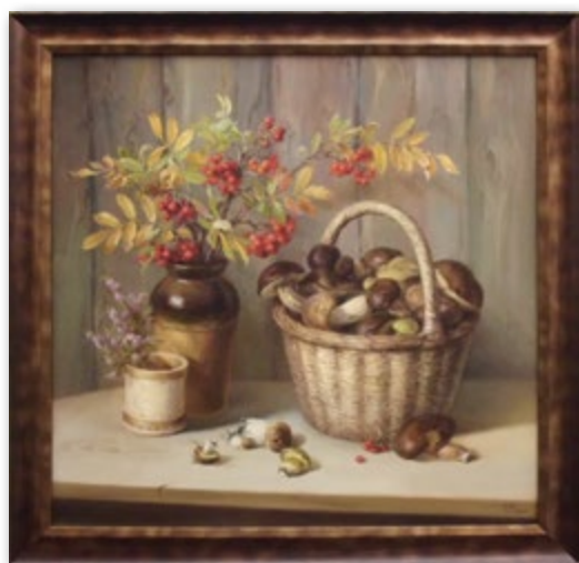
Still life with mushrooms and ashberry