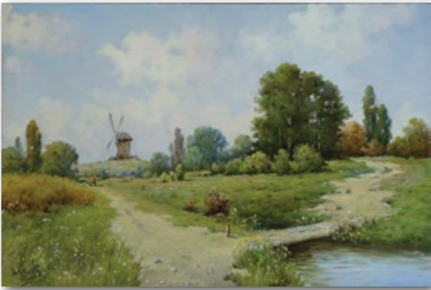
No23 Road of childhood canvas, oil, 40x60, 2015 Route d'enfance huile sur toile, 40x60, 2015