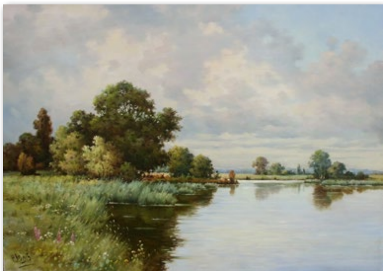
No55 : Summer's day canvas, oil, 50x70, 2015 : Beau jour : huile sur toile, 50x70, 2015