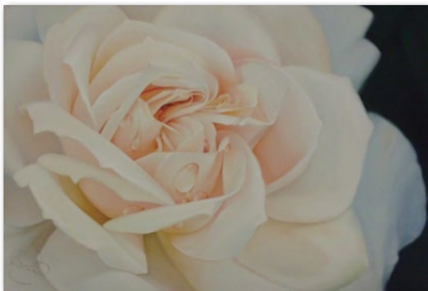
№99 White rose canvas, oil, 60x90, 2014 La rose blanche huile sur toile, 60x90, 2014