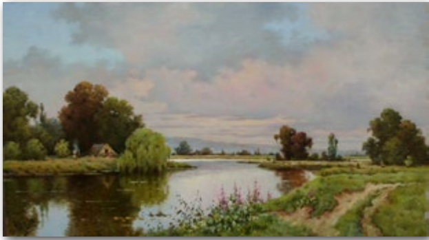
№35 Bay canvas, oil, 40x70, 2015 Baie huile sur toile, 40x70, 2015