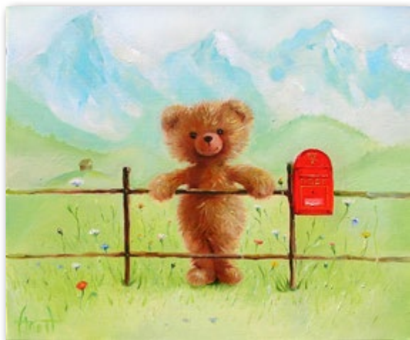
№50 Always Yours canvas, oil, 50x60, 2015 Toujourston huile sur toile, 50x60, 2015

Favorite painting - monochrome urbanism, street art and works for children and adults, who are still able to keep in touch with their inner child.