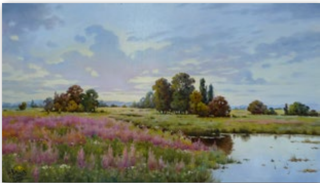
№39 Fast moving clouds in the sky canvas, oil, 40x70, 2015 Nuages dans le ciel huile sur toile, 40x70, 2015