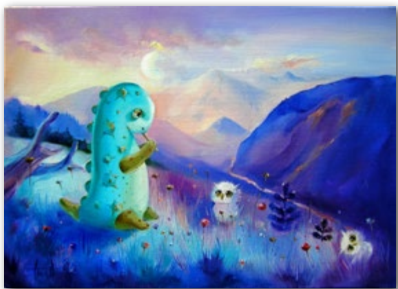
№68 Fairy Tale about a Snow Dragon canvas, oil, 50x70, 2015 Conte du dragonne igeux huile sur toile huile sur toile, 50x70, 2015