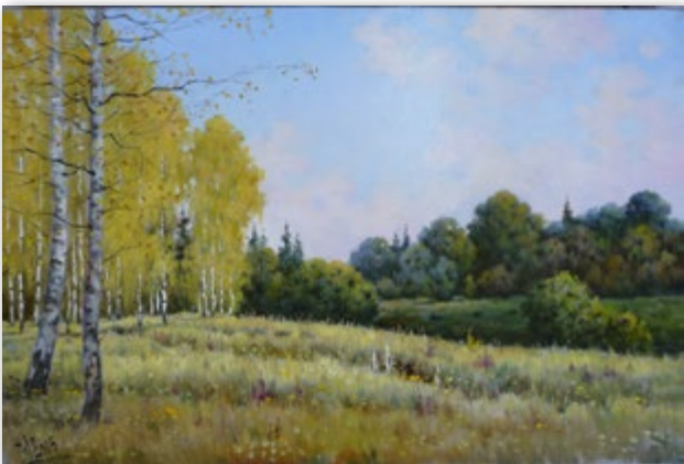
No25 Birches are shining with the azure blue canvas, oil, 40x60, 2015 Brillance des bouleaux huile sur toile huile sur toile, 40x60, 2015