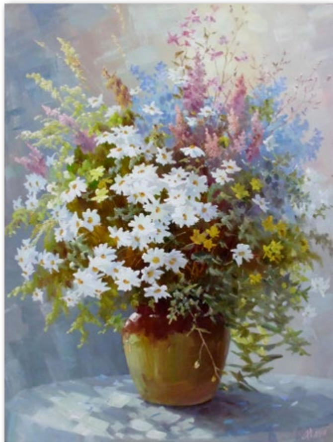
Bouquet with daisies

(Slovakia, Bratislava; Czeska Republika, Praga).