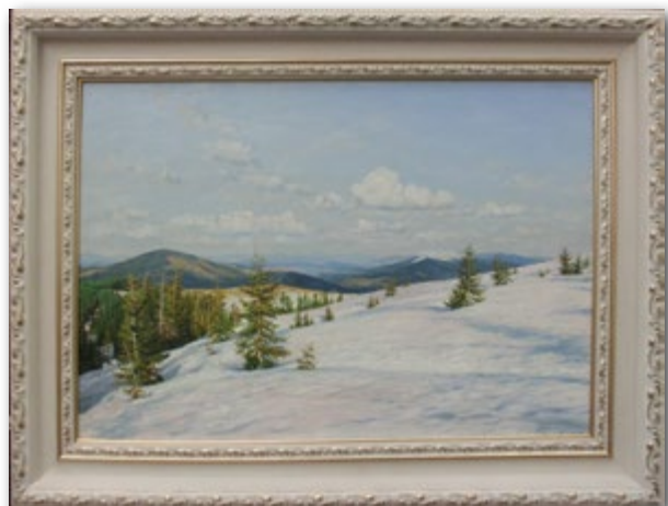
№32 Snow is melting canvas, oil, 40x60, 2011 Les neiges d'altitude commencent à fondre huile sur toile, 40x60, 2011

Awarded by the diploma for the participation in The collection № 5 «To Italy with Whole Heart» (Art Festival HOBBY SHOW ROMA - Italy, Roma, 14-16 October, 2011; Italy, Milano, 4-6 November, 2011).