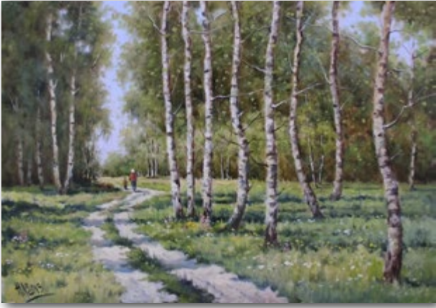
No9 Birchwood canvas, oil, 35x50, 2015 Boulaie huile sur toile, 35x50, 2015